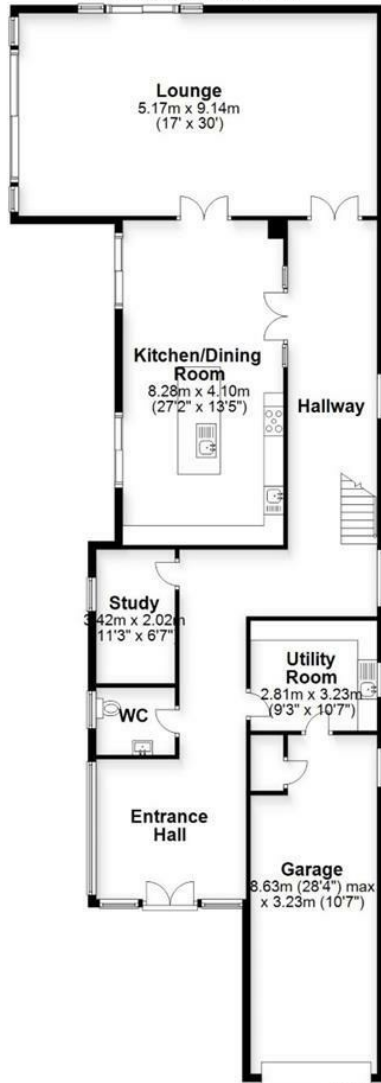
Main area: Approx. 316.2 sq. metres (3403.5 sq. feet) Plus garages, approx. 22.8 sq. metres (245.5 sq. feet) Plus balconies, approx. 25.5 sq. metres (274.9 sq. feet)